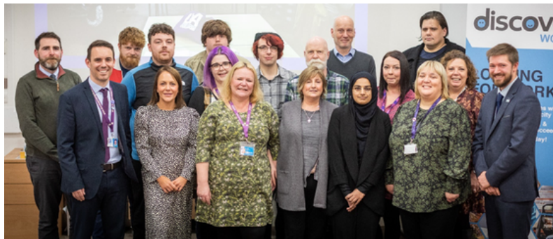
Candidates, staff and stakeholders from across the partnership at the course's celebration event (November 2022)

For the first time the entire cohort of a skills academy in Dundee has been offered a contract with an employer. All eight of the clients who participated in the Discover Work Partnership academy with Social Security Scotland have been offered 12-month fixed term contracts starting over the next few weeks.